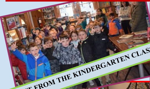
A VISIT FROM THE KINDERGARTEN CLASS